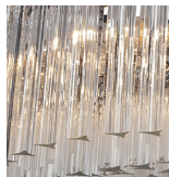
Clear Triangular Flat Cut