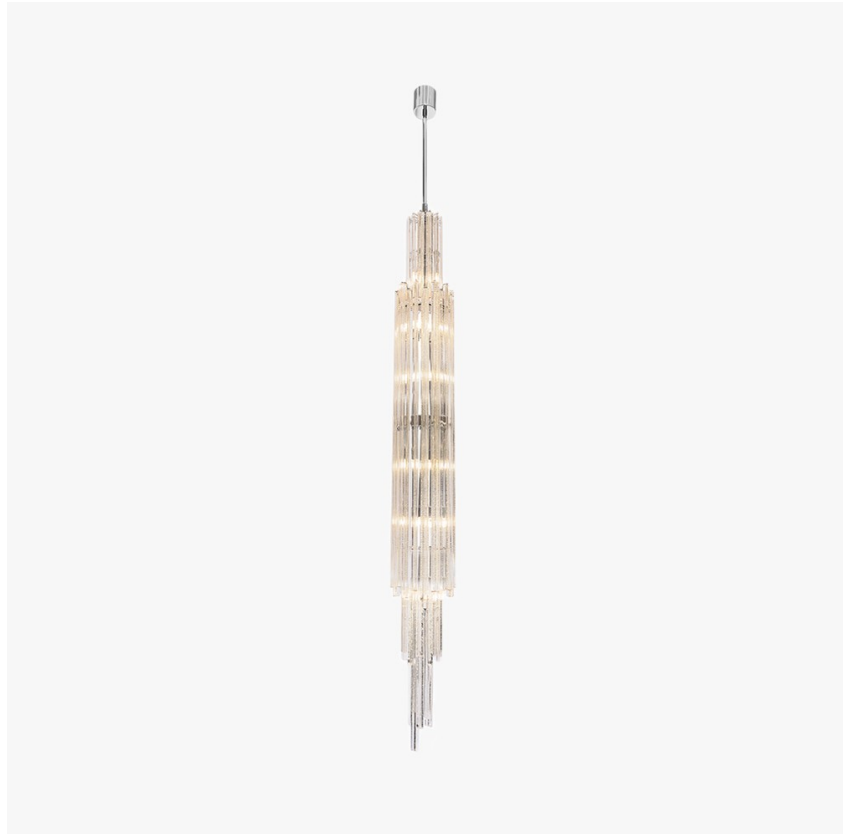
CL460-160 in Clear & Gold Triangular Flat Cut and Chrome

IEC (International Electrotechnical Commission) test certificates available - will incur a surcharge UL (Underwriters Laboratories) test certificates available for the USA - will incur a surcharge