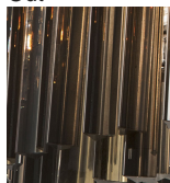
Smoke Triangular Flat Cut