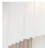
Satin Triangular Flat Cut