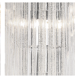
Clear & Silver Triangular Flat Cut