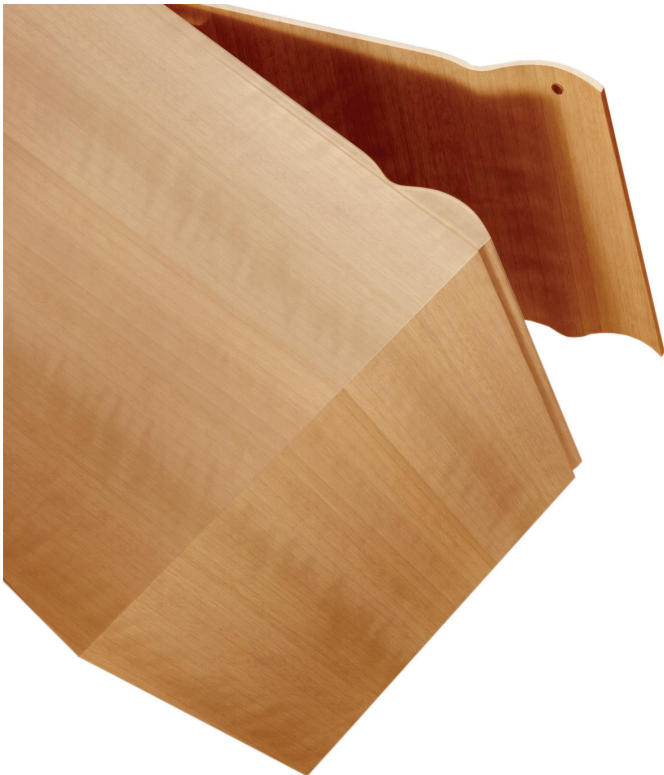
As shown: Satin Natural Anigre