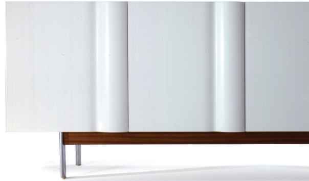
As shown: Polish Chalk Lacquer with Ebonized Mahogany apron.