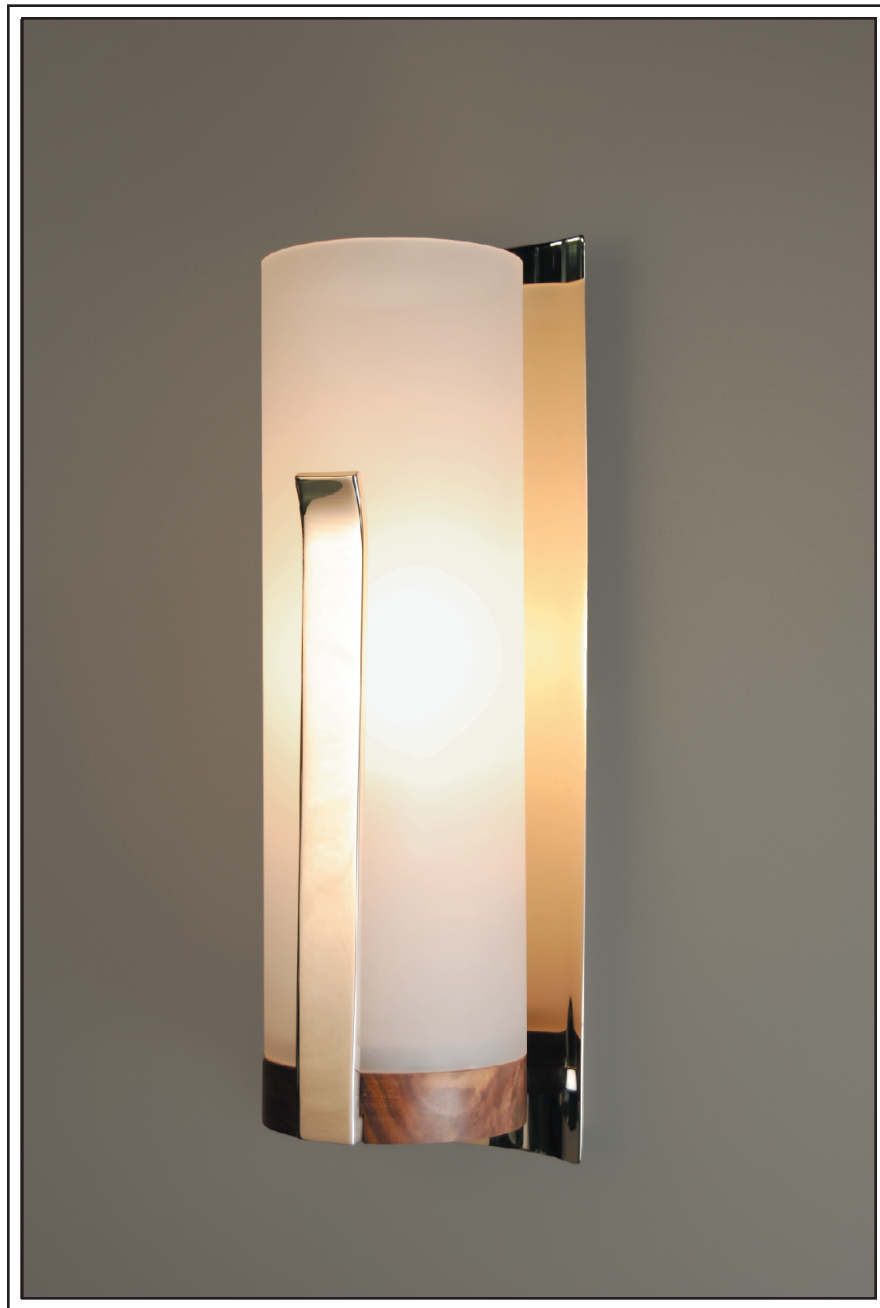
F2321 Kariri Sconce available with Ash or Walnut base pictured in Polished Nickel and Walnut designed by Antonio da Motta