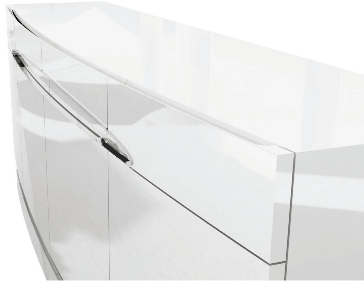
Shown carved handle detail on drawers and doors.