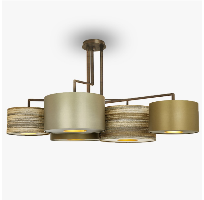
CL100-5 in Brushed Bronze with 16" Shades in COM Fabric 'Idrios Patina' from Romo and 1806W Timber Wolf