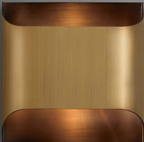
LECLERC SCONCE 10" x 10"