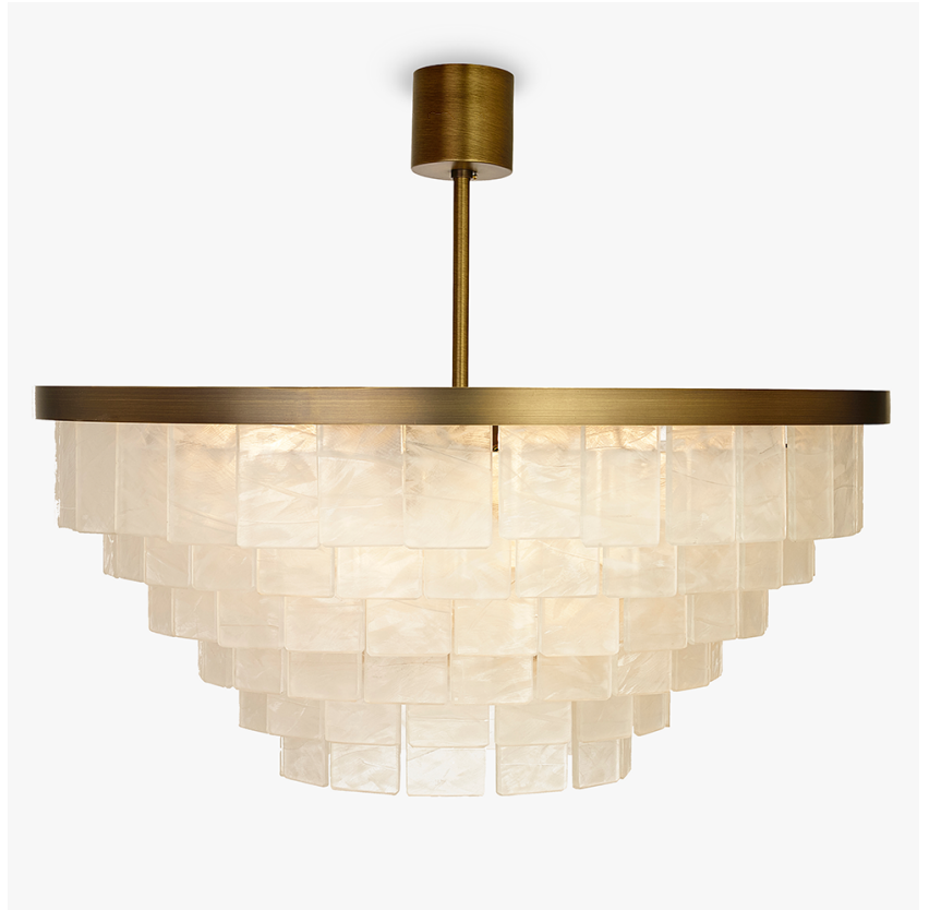
CL125-75 in Clear Hand-carved Lucite and Brushed Bronze