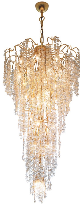
CL645-T-95 in Clear and Amber Murano Glass and Gold Leaf

IEC (International Electrotechnical Commission) test certificates available - will incur a surcharge UL (Underwriters Laboratories) test certificates available for the USA - will incur a surcharge