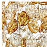
Clear & Amber