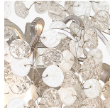
White & Clear