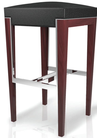
As shown: DJ Calf Black

As shown: DJ Leather, Satin Red Walnut Cherry, Polished Stainless Steel