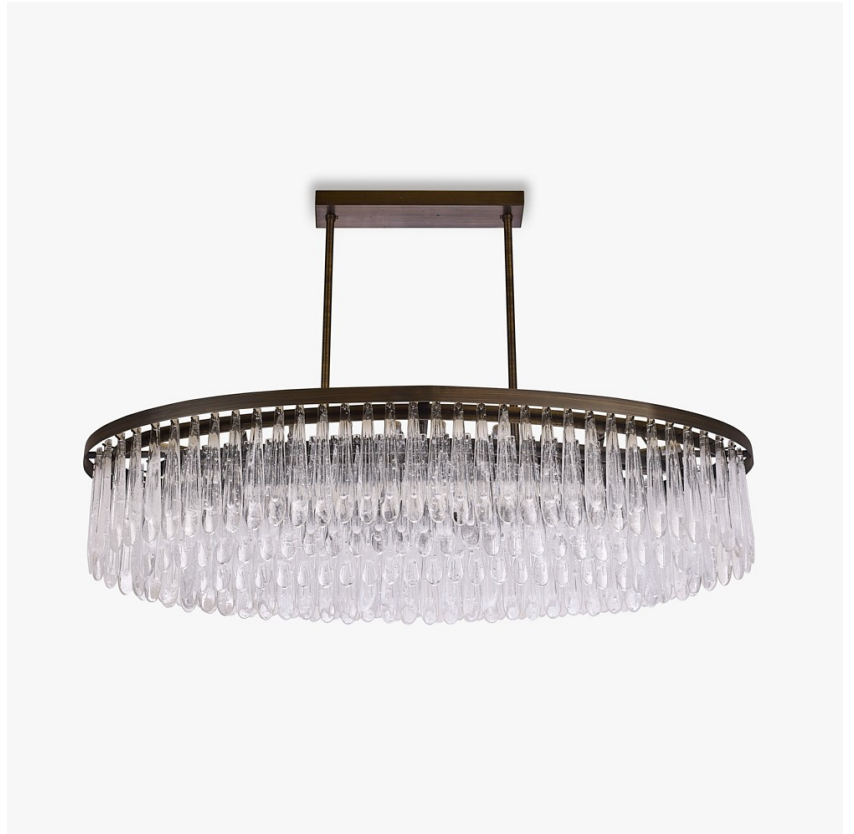
CL463-3T-O-120 in Clear Scallop Glass and Brushed Bronze