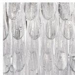
Clear Scallop Glass