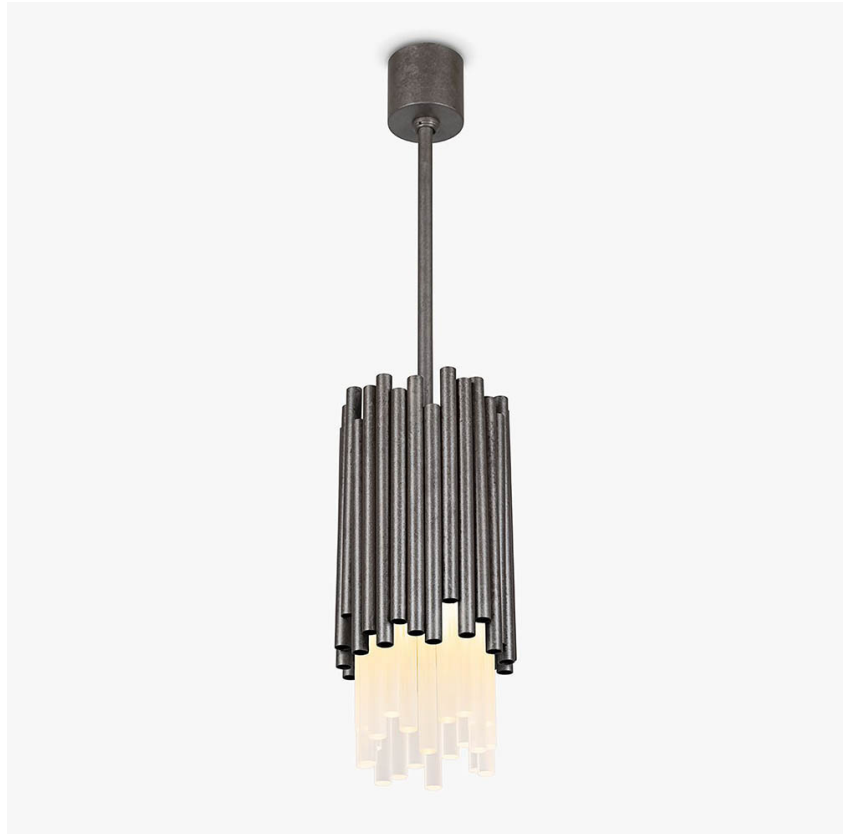
CL109-PEN in Frosted and Stippled Silver

UL (Underwriters Laboratories) test certificates available for the USA - will incur a surcharge Suitable for Yachts - Rod and bolting available for use on yachts IEC (International Electrotechnical Commission) test certificates available - will incur a surcharge