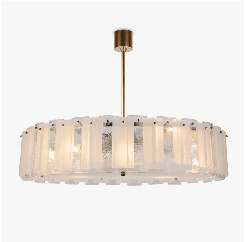
CL213-RO in Satin with Clear Glass and Brushed Gold