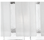
Lunar Satin with Clear