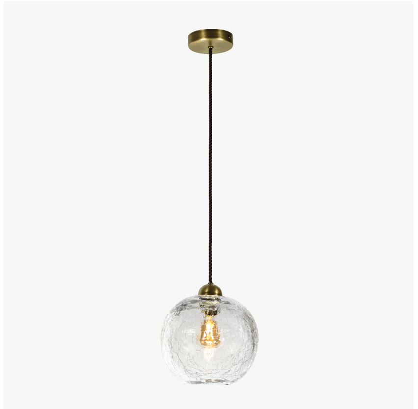
CL375 in Clear Crackled and Brushed Bronze with Brown Flex

Glittering crevasses lace the surface of our Arctic range, glinting flawlessly as they catch the light. A classic crackle technique made in England from pure lead crystal for heightened clarity and allure; these pieces provide stand alone simplicity or are the perfect complement to our intricately cut Glacier range. Use them individually or make use of our customisation service to group several together for a completely individual look.