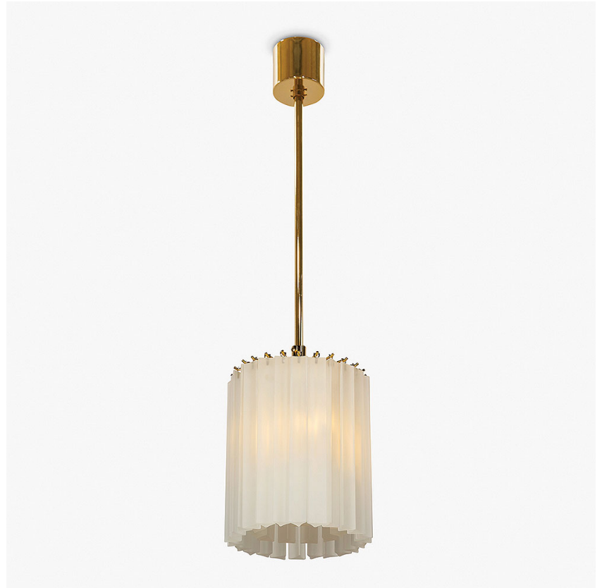
CL412-25 in Satin Triangular Flat Cut Murano Glass and Polished Gold

IEC (International Electrotechnical Commission) test certificates available - will incur a surcharge