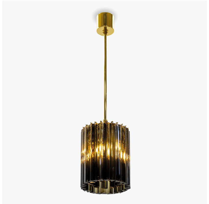
CL412-25 in Smoke Triangular Flat Cut Murano Glass and Polished Gold

UL (Underwriters Laboratories) test certificates available for the USA - will incur a surcharge IEC (International Electrotechnical Commission) test certificates available - will incur a surcharge