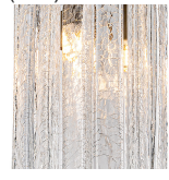
Clear Cracked (Flat)