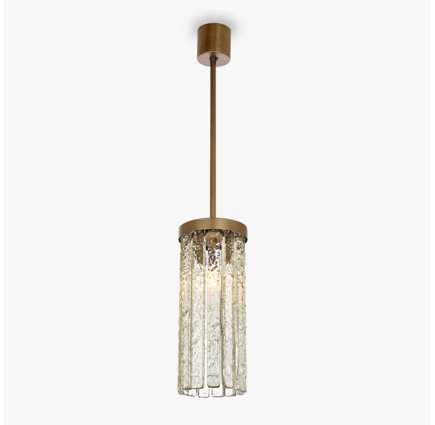
CL455 in Clear Hammered and Brushed Bronze

IEC (International Electrotechnical Commission) test certificates available - will incur a surcharge UL (Underwriters Laboratories) test certificates available for the USA - will incur a surcharge