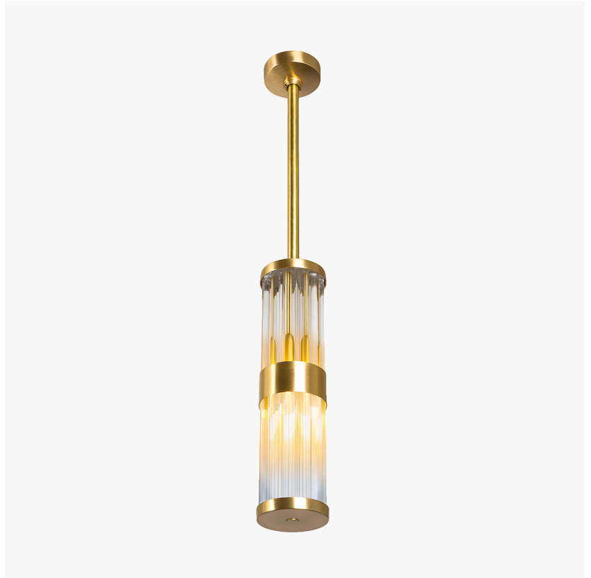
CL121-PEN-12 in Clear Lucite and Brushed Gold

Modelled on our iconic Curzon Street chandelier the new Curzon Street pendant is a welcome addition to the range. With its long, slender design this would look elegant and chic in any given interior. Available in either clear or frosted Lucite and a number of sizes.