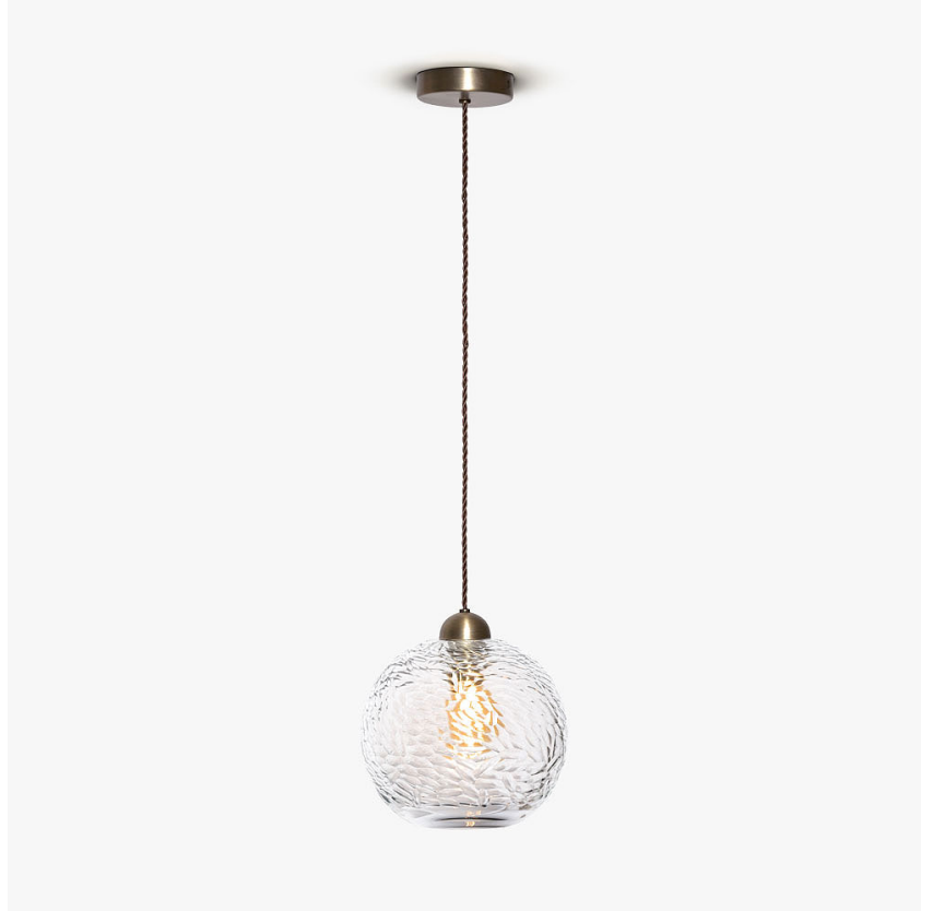
CL376 in Clear Battuto and Brushed Bronze and Brown Flex

The finest quality English lead crystal is carved in a fashion that mimics the patterns etched into the weather beaten walls of glacial caves. Drawing on the Murano glass craft of 'Battuto' whose name itself derives from the Italian word for 'beaten', our Glacier pendant and table lamp have every facet carved out individually by our English crystal experts. Use them individually or make use of our customisation service to group several together for a completely individual look.