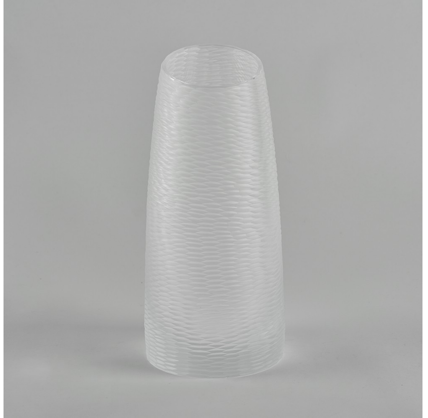
Harlequin Vase in Clear