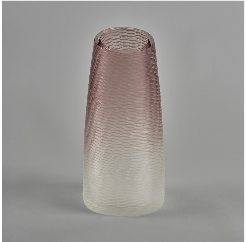
Harlequin Vase in Faded Rose Quartz