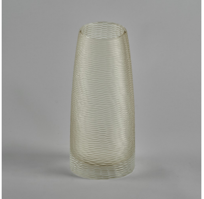
Harlequin Vase in Pale Amber