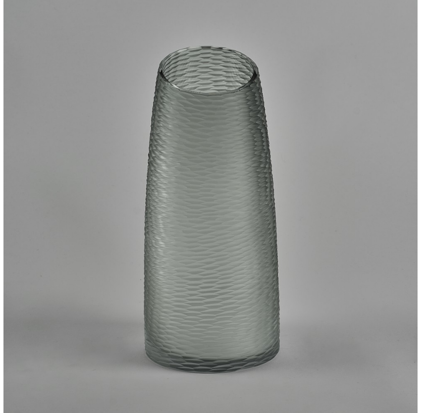
Harlequin Vase in Slate