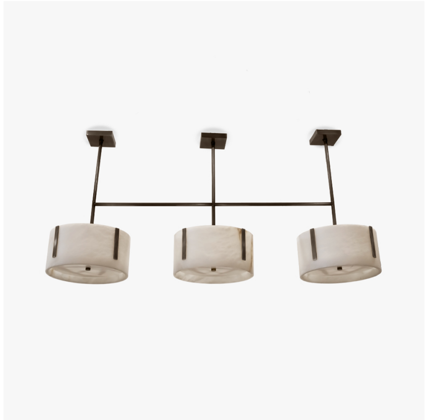
CL805 in Alabaster and Brushed Bronze