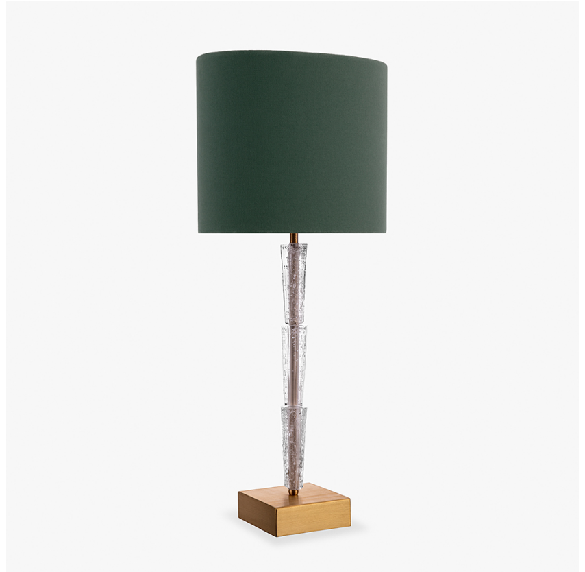
TL212 Nilssen in Brushed Gold with a 12" Oval Shade in 1806W-120

Although this series of designs has totally evolved, the roots of the design are centred around the work of silversmith Wiwen Nilssen. Considering the corners and facets of his tableware creations, we have softened the geometry of Nilssen's iconic design language and arrived at these stacking glass elements, infusing their cores with richly bubbled detailing which glitter brilliantly when illuminated.