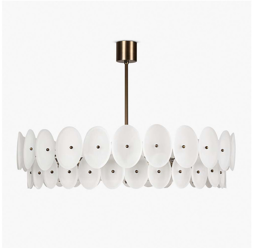
CL61-2T in Alabaster and Brushed Bronze