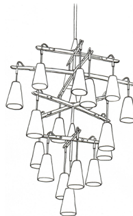
CHANDELIER 17 4059A