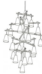
CHANDELIER 21 5078B