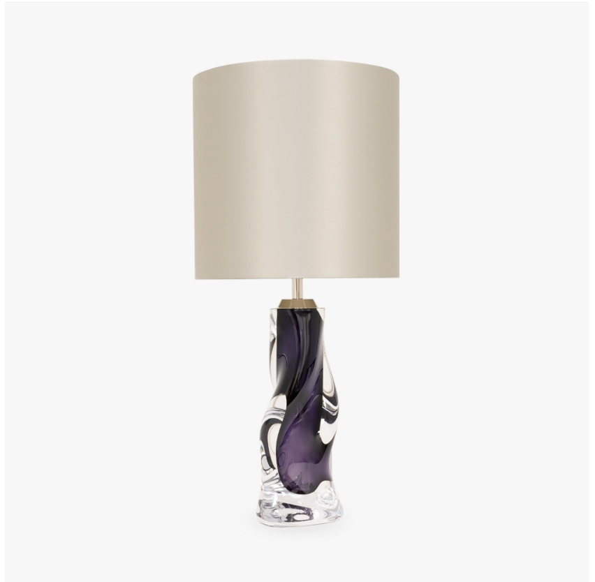
TL816 in Indigo & Polished Nickel

Each Vortex table lamp is a unique art form. No two pieces are exactly the same, owing its sculptural form to a completely handmade, mould-free creation which allows for the unconstrained formation of each lamp's graceful twists and folds. We find ourselves entranced by the frozen fluidity of the Vortex glass, which evokes contemplation with its extraordinary beauty. IMPORTANT NOTE - Amber and Midnight glass finishes are currently only available as singles.