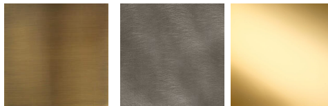
Antique Brass Pewter Polished Brass