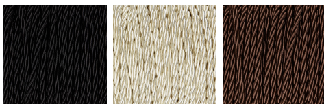
Black Cream Brown